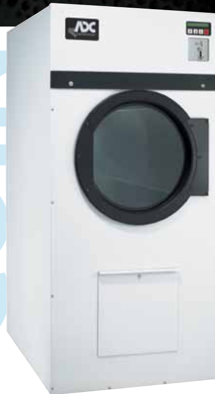
AD-50V Coin Dryer